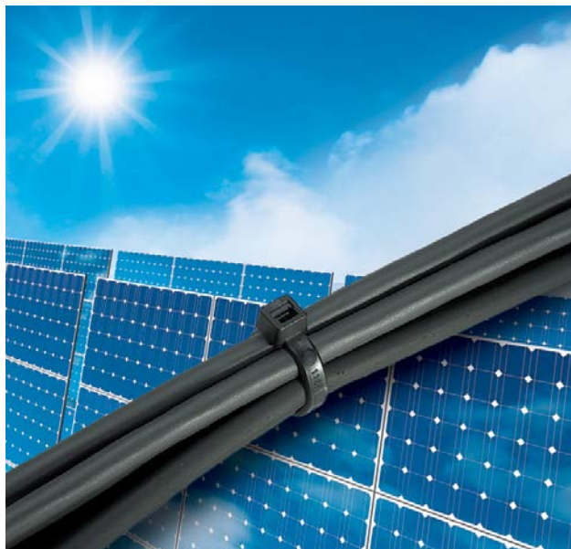
Figure 2: Intense UV rays can damage a wire tie, so Phoenix Contact offers options that can withstand UV rays for up to 10 years.

In the food and beverage industry, blue is the preferred color for non-edible components. The number of blue foods is