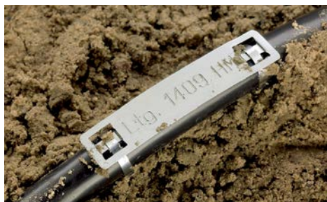
Figure 1: Stainless steel cable ties are ideal for harsh environments.

Once the length and tensile strength are determined, the next step is to choose the appropriate material of the wire