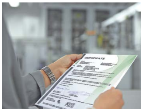
Surge protective device type 2